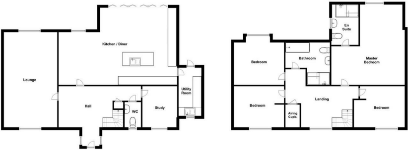
This floor plan is not to scale and is for illustrative purposes only. We make no guarantee, warranty or representation as to its accuracy and completeness.